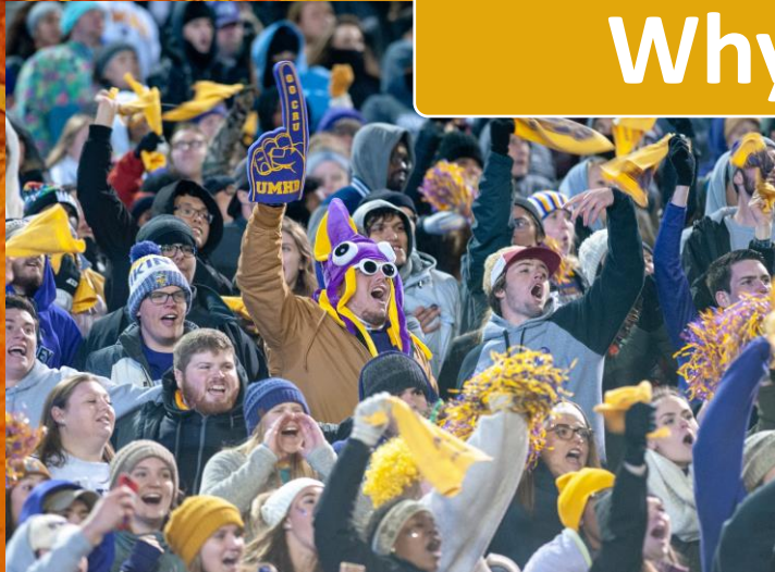
Unity (color, highs/ lows)