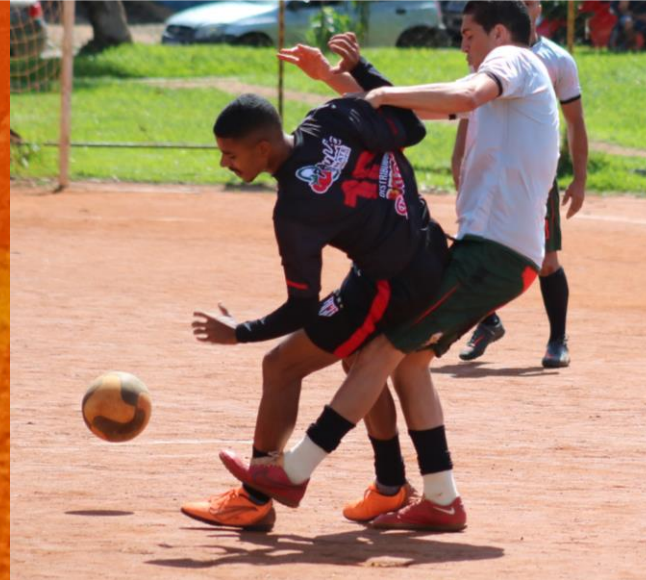
Disunity (trying to hurt)